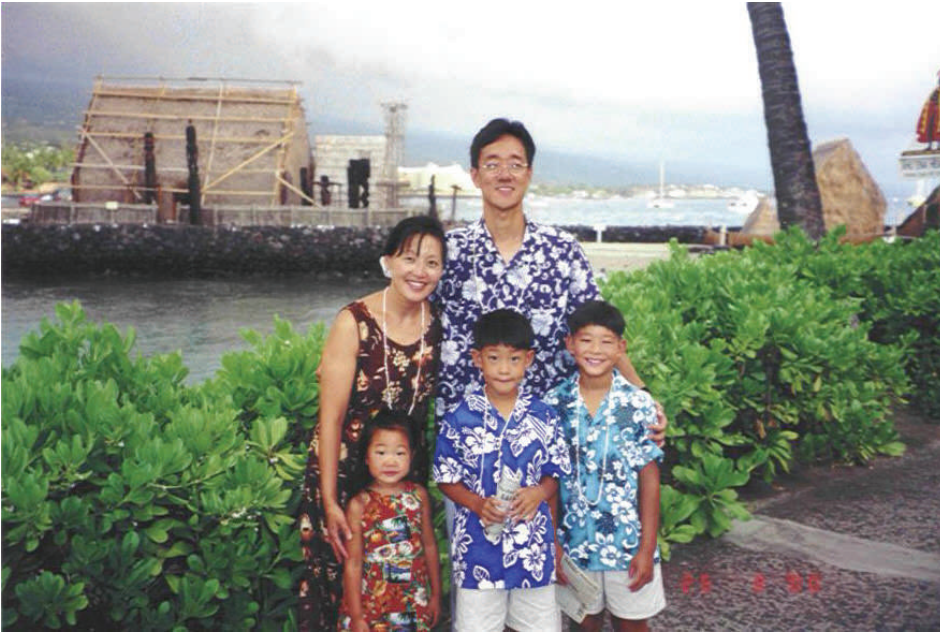
At Crossroads DTS (YWAM base) in Kona, Hawaii at the onset of their ministry.

Christ in a miraculous way. I met him while teaching computer classes at the state university. He was pursuing a Ph.D in philosophy, and was fluent in English. We hired him as our Uzbek language teacher, and asked him to teach us the language using the Uzbek Bible. It was the first time that he even saw a Bible in his own language, and he read the entire New Testament in two months. There began a struggle in his heart: Which is true, the Bible or the Quran? Who is the true prophet of God: Jesus or Muhammad? God answered his questioning heart in an amazing way.